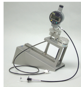
Balloon compliance fixture