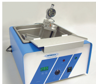
Temperature-controlled water bath